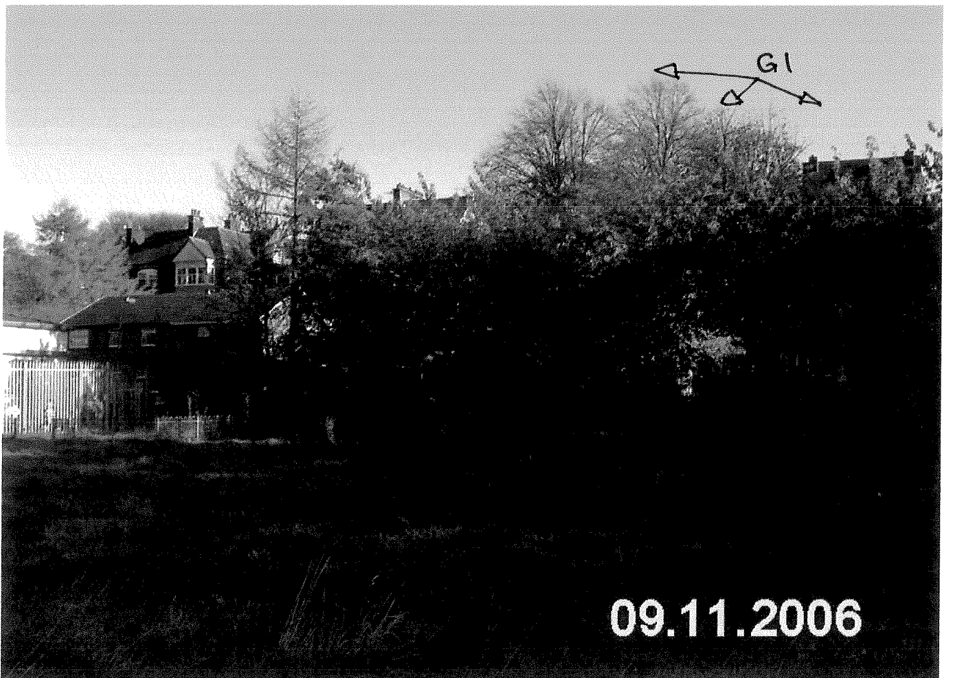
G1 Viewed From the land between Lancaster Boys Club and Villas Court.