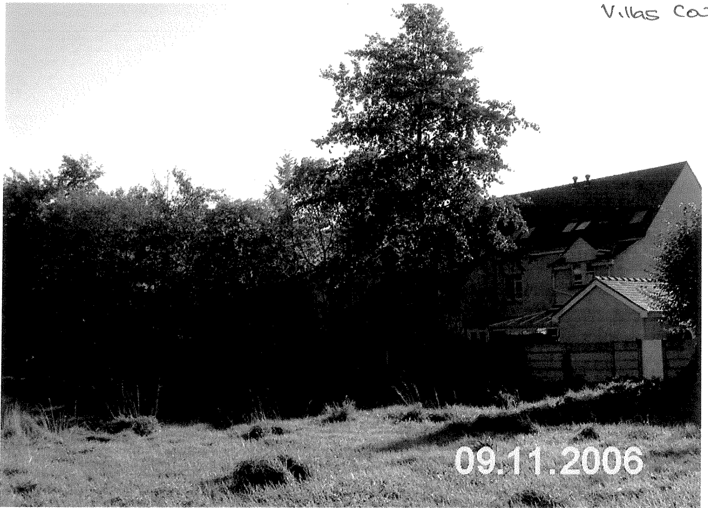
G2 Viewed From land between Lancaster Boys Club + Villas Court.